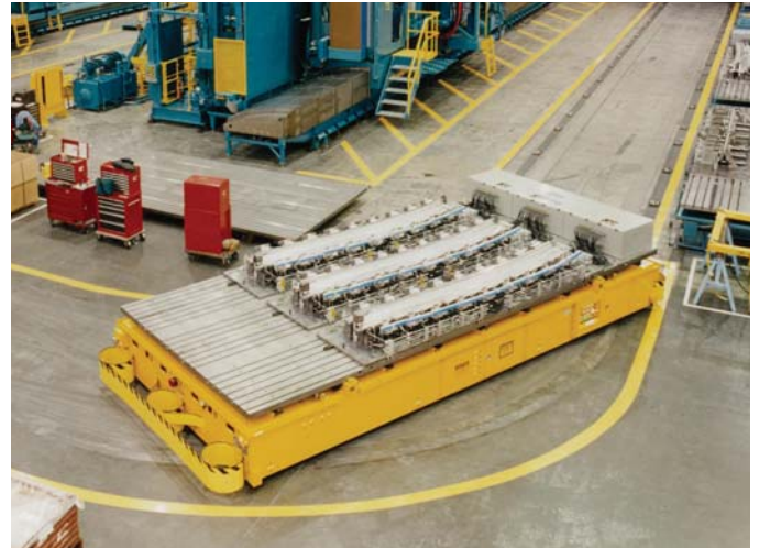
High-accuracy 30-Ton AGV Utilized at an Aircraft Manufacturer