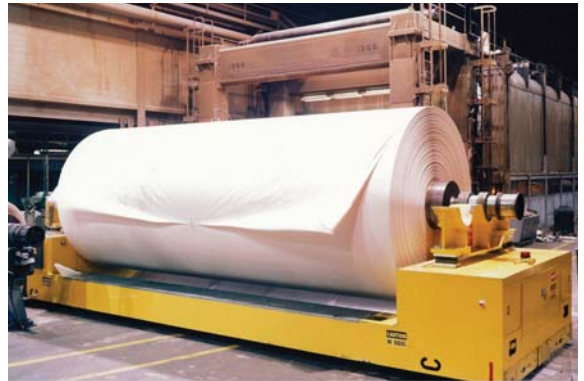
30-Ton Capacity Jumbo Paper Roll Automated Transfer Car