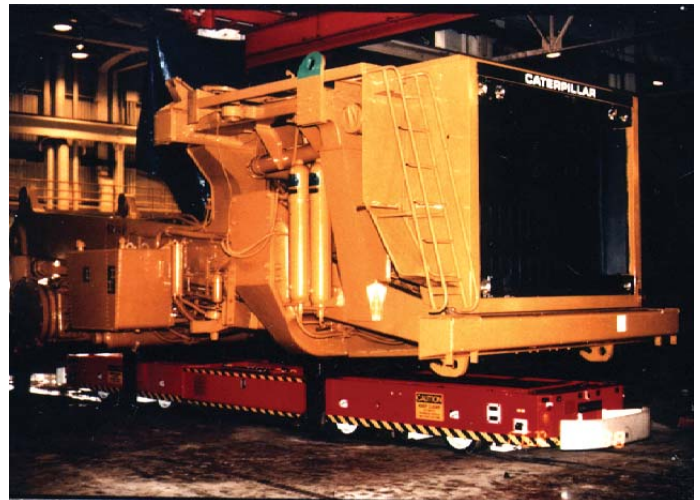
48-Ton Capacity Ultra Low Profile Vehicle Moves Earth Grader and Dump Truck Chassis Between Assembly Operations