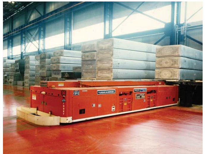
This AGV Delivers Aluminum Ingots to Storage Using a Vehicle Mounted Lift/Lower Deck