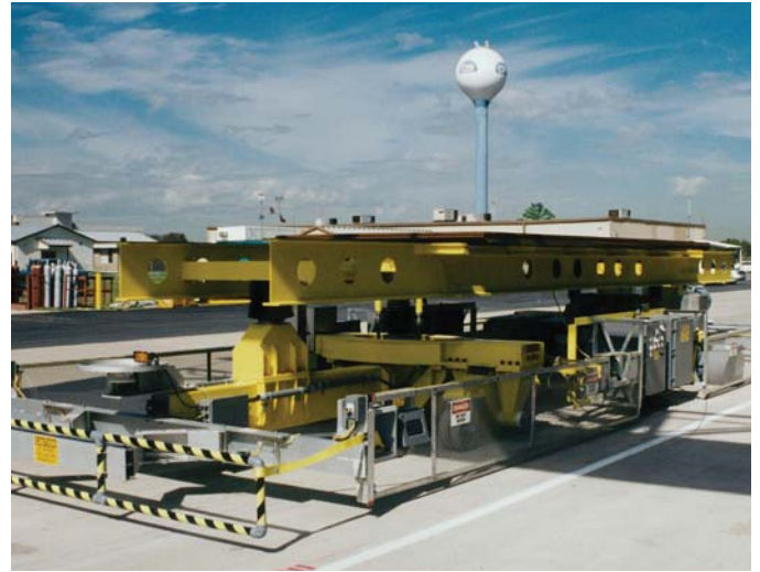
25-Ton Capacity, Laser-guided Outdoor Vehicle at a Bridge and Iron Work Facility in Houston, TX