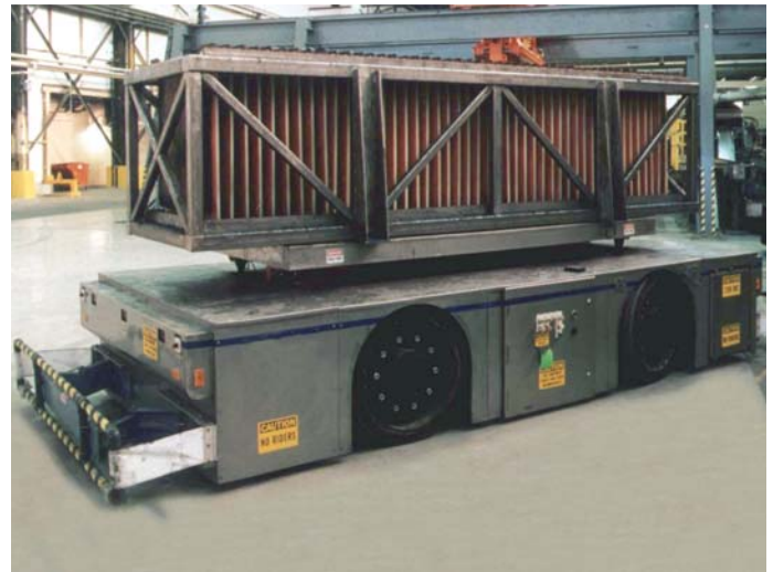
One of a 7-vehicle 22-Ton Capacity AGV System in a Western U.S. Copper Refinery

From initial concepts through system implementation, Webb provides all the necessary services to design, manufacture, and install an AGV system in your facility. Pre-shipment vehicle and system testing is performed by trained professionals for quick and easy integration into your facility. All support equipment, controls and communication can be engineered to meet your exact system specifications. As your needs change, system modifications or enhancements are easily incorporated into new system requirements.