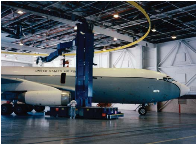
AGV Transport for Robot Used to Paint/De-paint Aircraft