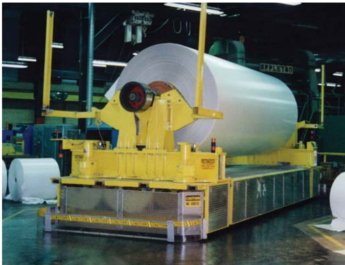
25-Ton Capacity AGV for Jumbo Roll Handling in German Paper Mill