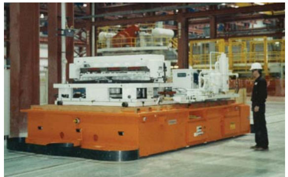
Rail-guided Vehicle Transports Automotive Dies

Put a Webb AGV or Rail Car System to work for you.