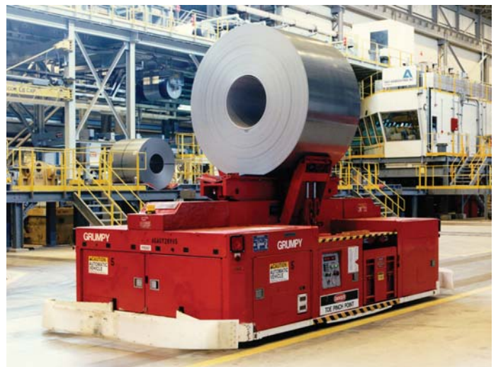
50-Ton Capacity Vehicle Transports Steel Coils to Cantilevered Pick/Drop