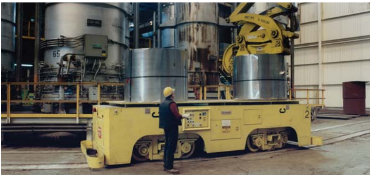
60-Ton Capacity Automated Coil Handling Rail Car System