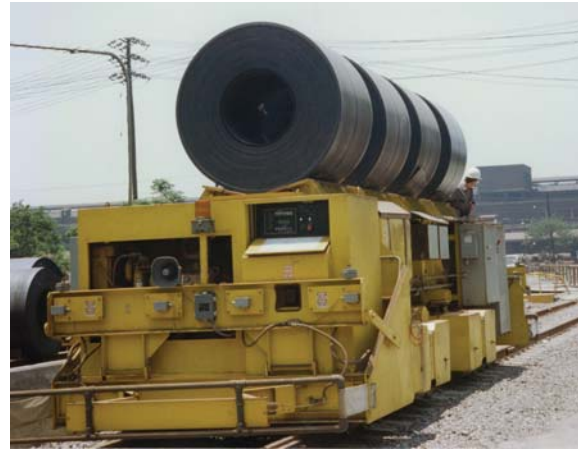
Rail-guided Outdoor Coil Delivery System

Our commitment to quality is evident in every vehicle we design and manufacture. From initial engineering to production and installation, we take the necessary steps to do it right the first time. Superior materials and workmanship combined with rigorous testing procedures assure each transfer car will provide years of reliable service.