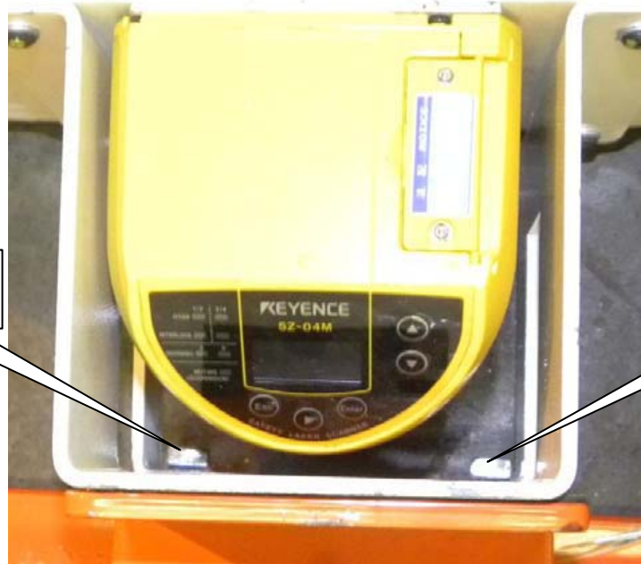
Locating Tab in Position