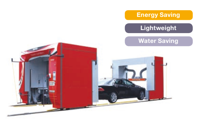
Drive-through car wash machine—Twinfect Force

Daifuku is aware of the importance of environmental considerations in its business management and endeavors to enhance its environmental efforts in all aspects of corporate activities. As a measure of its CSR activities, the Company has implemented the Daifuku Eco-Products Certification Program, which rates and certifies products based on in-house standards, and now has 15 certified products. The program, which started in November 2012, rates every product manufactured within the Daifuku Group in the following terms: energy saving, recyclable, lightweight, long life, resource saving, water saving, low noise, clean water preservation, and harmful substances reduced.