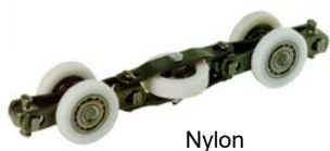
Nylon wheel chain