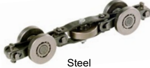
Steel wheel chain