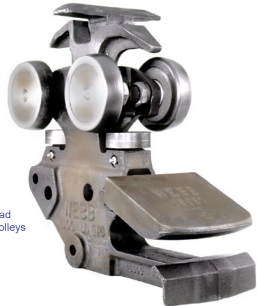
Overhead Free Trolleys