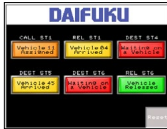
6 Button Panel Configuration 3.5"